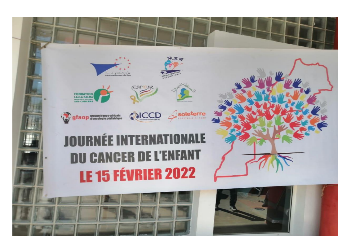
Posters presentation during ICCD 2022