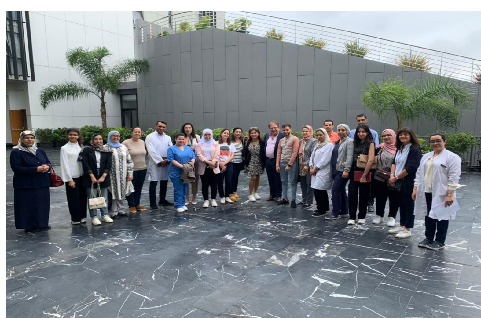
Nurses scientific day transfusion