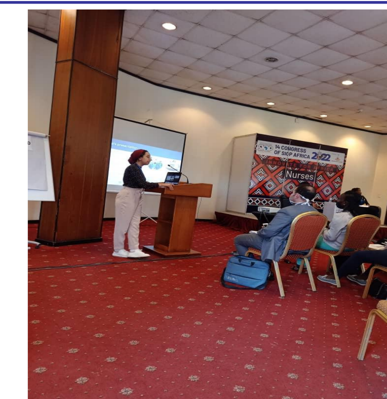
Moroccan Nurse presenting during SIOP Africa meeting Uganda 2022