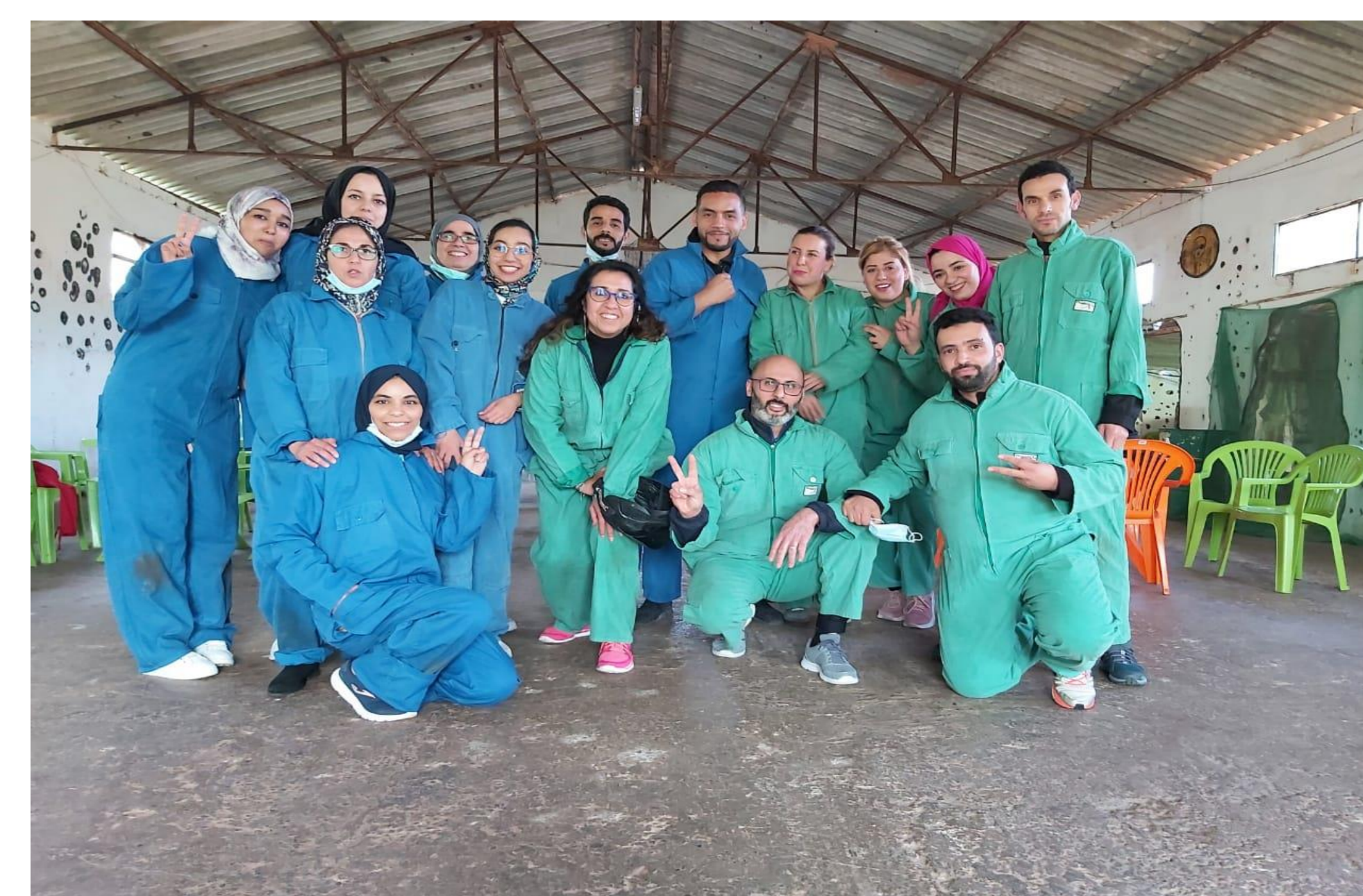
Team building session – Paint ball