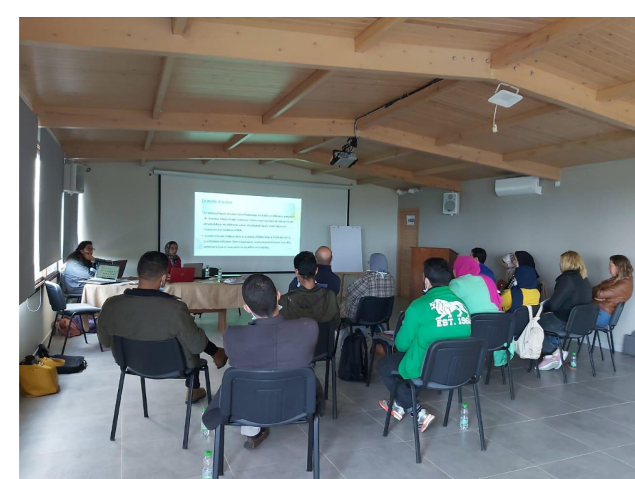
Nurses scientific day in Rabat